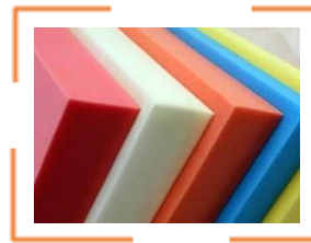
Expanded PP EPP