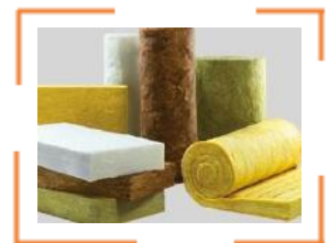
Mineral- & Glas Wool