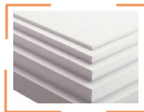
Polystyrene EPS, XPS