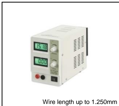
Wire length up to 1.250mm