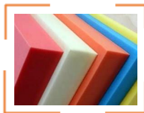
Expanded PP EPP