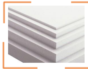
Polystyrene EPS, XPS