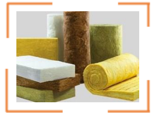
Mineral- & Glas Wool